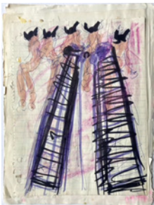
Purvis Young Untitled , ca. 1980 – 1999 Ink on paper 29 x 20 cm (11 2/5 x 7 4/5 in.)