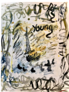
Purvis Young Untitled , ca. 1980 – 1999 Paint on paper 65.4 x 50.2 cm (25 3/4 x 19 3/4 in.)