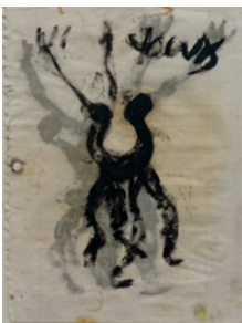
Purvis Young Untitled , ca. 1980 – 1999 Ink on paper 29 x 20 cm (11 2/5 x 7 4/5 in.)