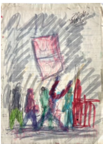
Purvis Young Untitled , ca. 1980 – 1999 Ink on paper 29 x 20 cm (11 2/5 x 7 4/5 in.)