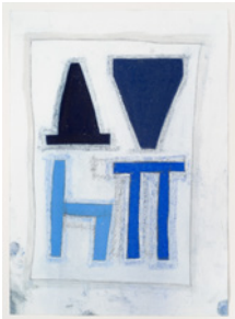
Julian Martin Untitled, 2010 Pastel on paper 34.9 x 25.1 cm (13 3 / 4 x 9 7 / 8 in.)