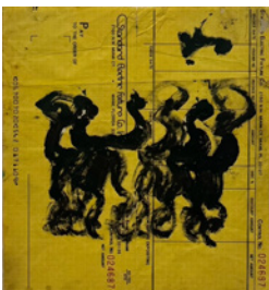
Purvis Young Untitled , ca. 1980 – 1999 Paint on paper 29 x 20 cm (11 2/5 x 7 4/5 in.)